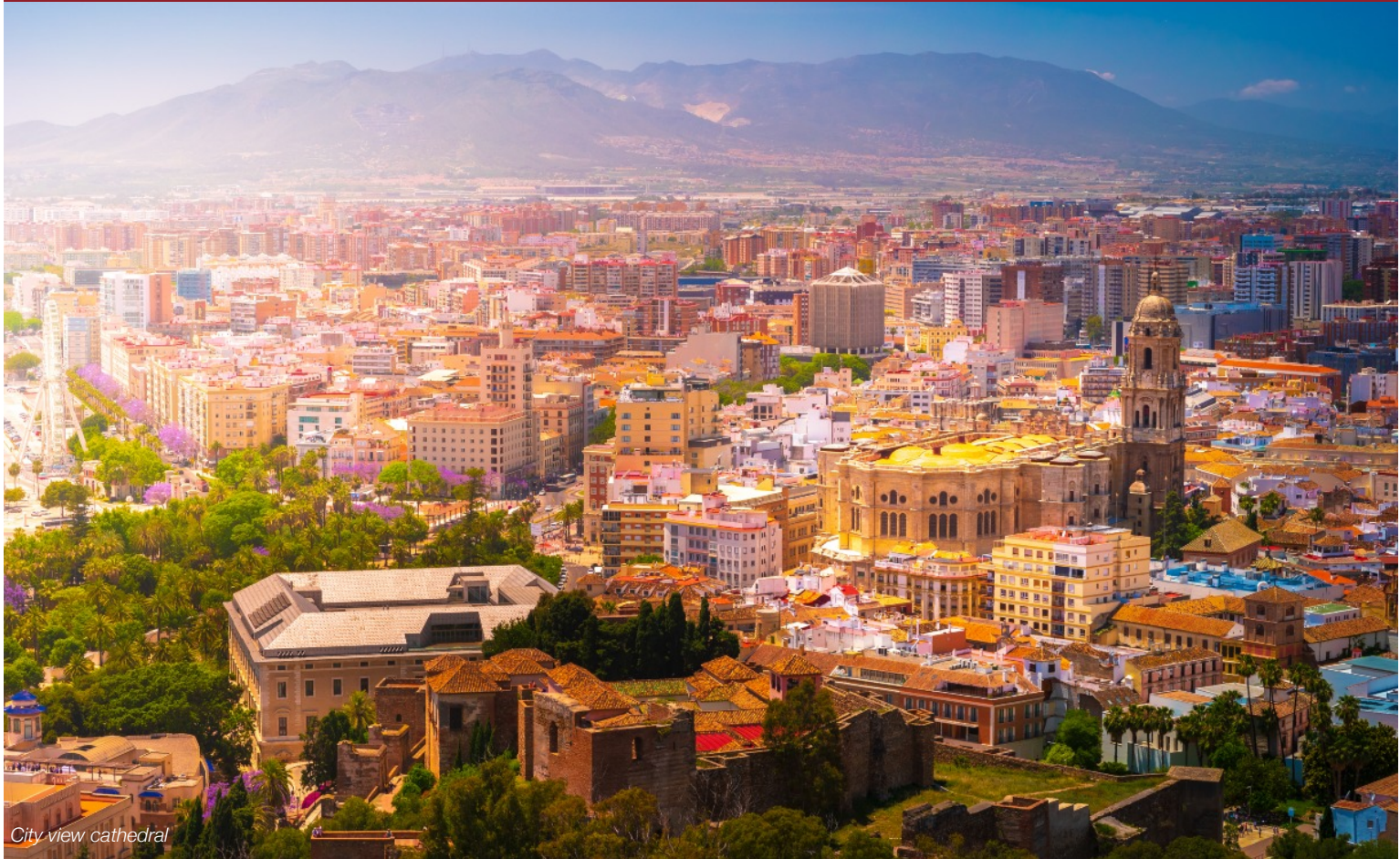
City view cathedral