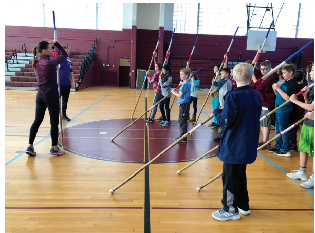
Olympian pole vaulter Stacey Dragila.