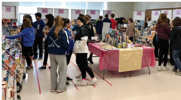
Students stock up on reading materials at the bookfair.